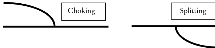
Figure 2: Schema of CAPTURE (choking) and EMISSION (splitting)